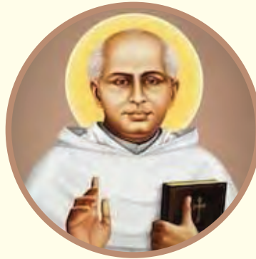
ST. KURIAKOSE ELIAS CHAVARA