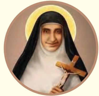
ST. EUPHRASIA ELUVATHINGAL