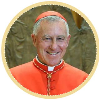
CARDINAL JOHN ATCHERLEY DEW, NEW ZEALAND