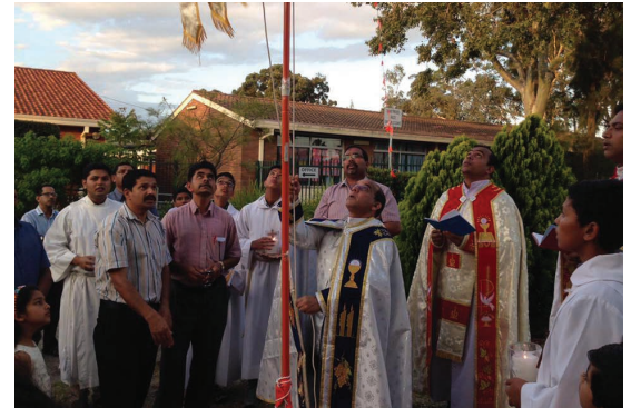
Feast of Christ the King at Christ King Mission Holsworthy, Sydney