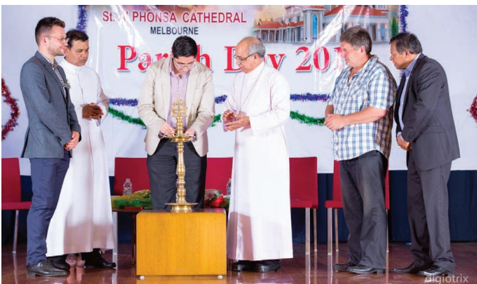
Parish Day Celebrations: St Alphonsa Cathedral Melbourne North