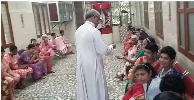
Unnikoru uduppu: Rs 11,000,00, collected from the parishes and missions of the eparchy during Christmas 2015, were handed over to the Little Sisters of Divine Providence Kunnamthanam, Kerala who look after a number of mentally and physically challenged persons