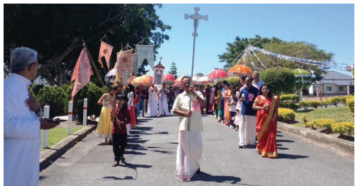
Feast of Our Lady at Mary Matha Mission Gold Coast