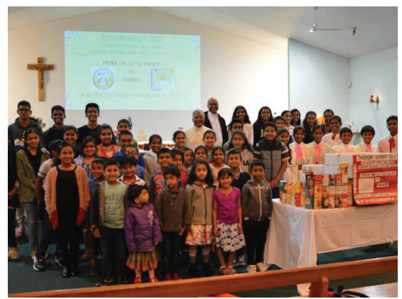
Mission Sunday Celebrations by St Mary's Sunday School Adelaide South