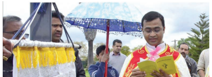
Feast of St Alphonsa: Shepparton