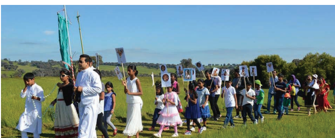
Rosary Procession at Wagga-Wagga