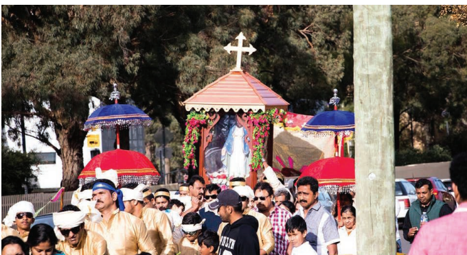
Ettunombu thirunna: St Mary's Knanaya Mission Melbourne