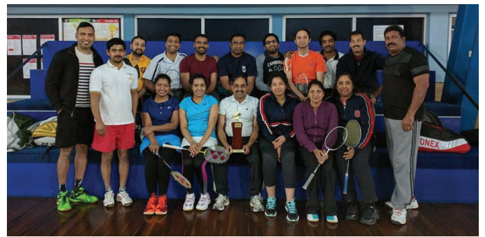
The Syro-Malabar Melbourne team who won the badminton tournament organized by St Thomas Ecumenical Fellowship Melbourne