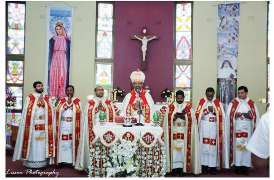
Feast of St Alphonsa: St Alphonsa Parish Canberra