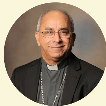
Bishop Bosco Puthur