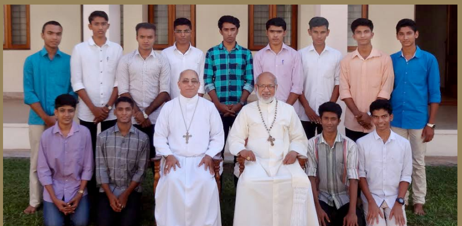
Seminarians for the Eparchy of St Thomas, Melbourne

From the Eparchial Curia, Preston, Melbourne 13 March 2016.