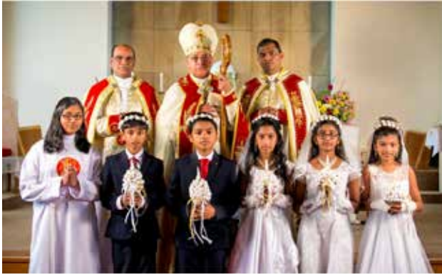
Confirmation and Holy Communion: St Thomas Mission Wollongong