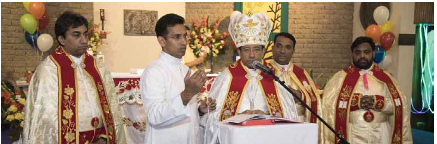
Visit of Mar Kurian Vayalumkal, the apostolic Nuncio of Papua New Guinea and Solomon Islands to St Mary's Knanaya Mission Melbourne