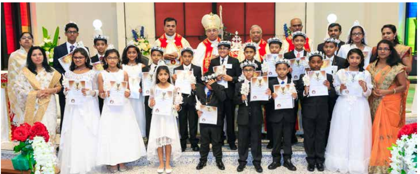
Confirmation and Holy Communion at St Alphonsa Cathedral Melbourne North