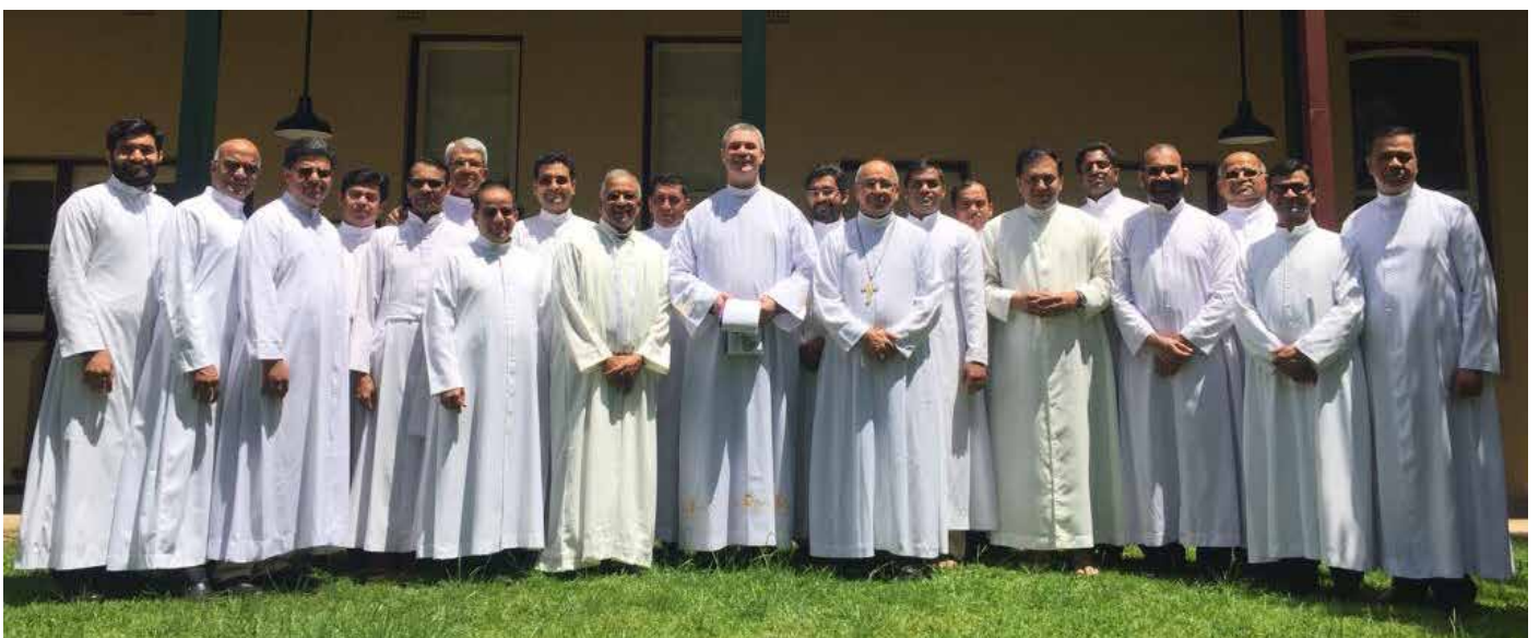
Annual Retreat of the priests working in the eparchy with Bishop