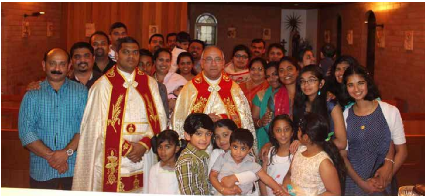
Bishop's visit at the Bowral community