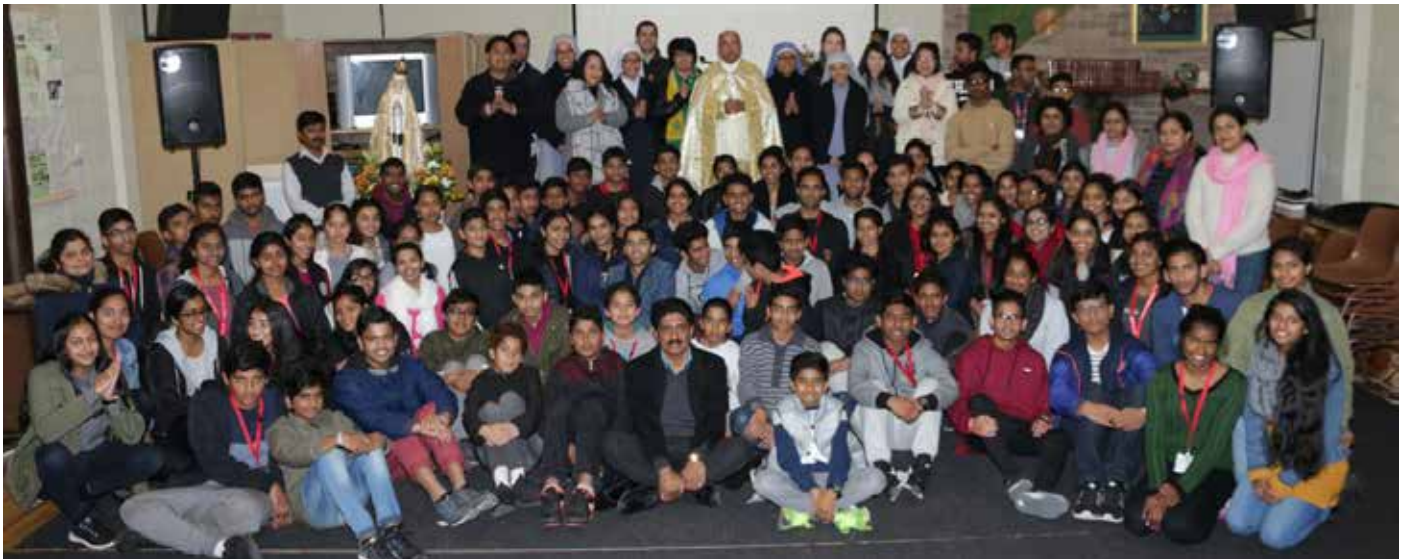
Youth camp participants and volunteers with bishop on the concluding day - mount morton camp centre Belgrave heights South east Melbourne.