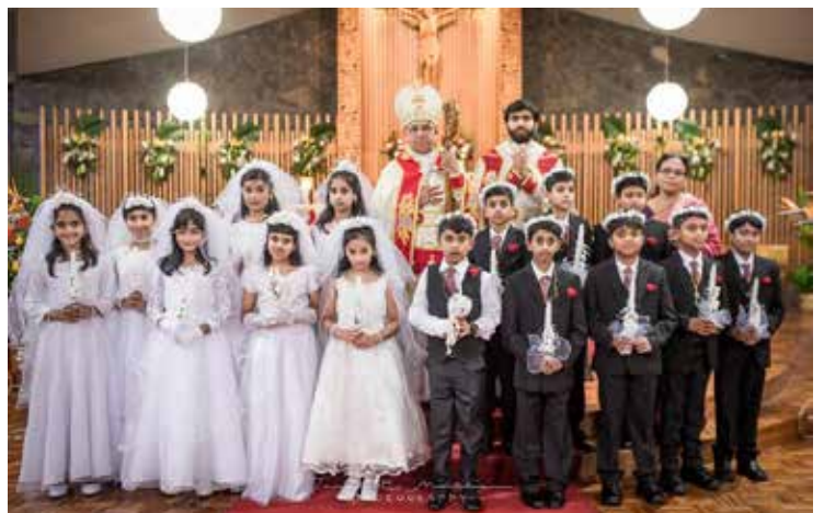
Holy Communion: St Alphonsa Parish Canberra