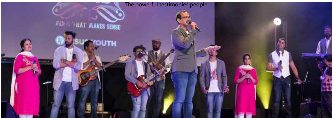
The powerful testimonies people

who attended the concert and the hard work many priests and laymen undertook in the organisation of the tour would continue to keep the flame of faith strong and witnessing to people around us. Thank Almighty God for the protection and anointing all received through the tour may help us to witness our faith in this land with more vigour and value.