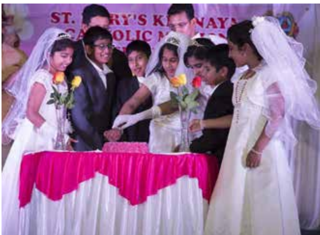
Holy Communion: St Mary's Knanaya Mission Melbourne