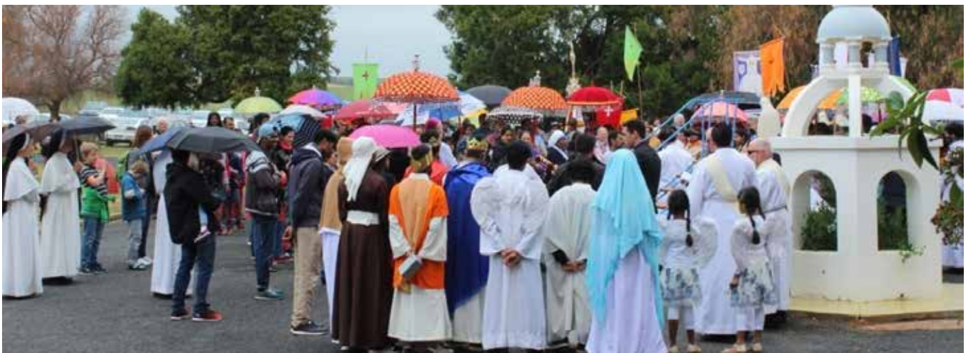
Marian Procession by St Alphonsa Parish Canberra