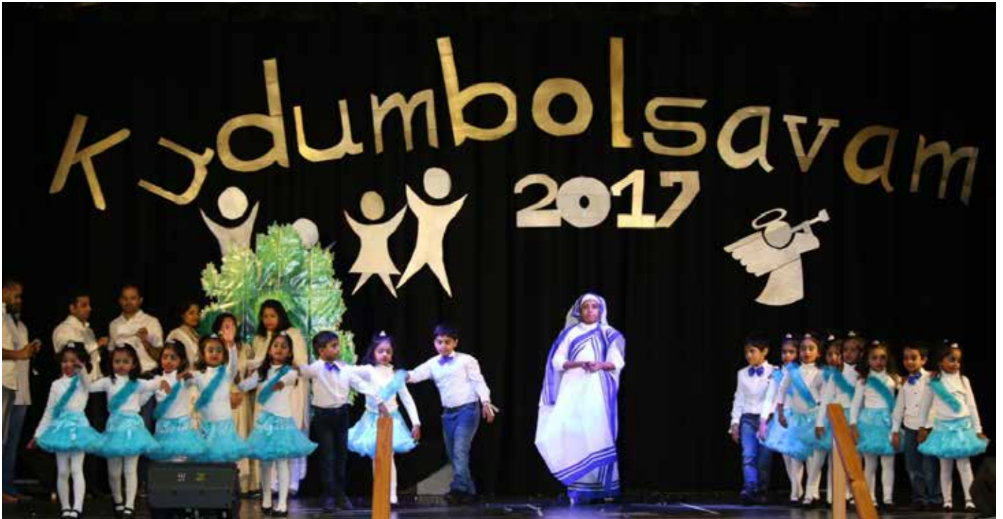
Kudumbolsavam 2017 ST. Thomas parish Melbourne south East.