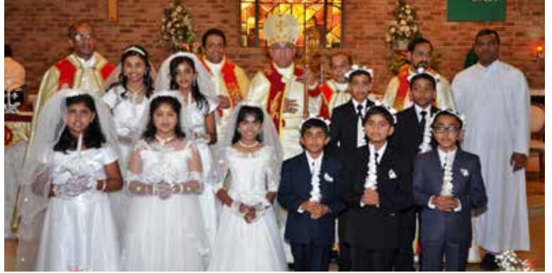
Confirmation and Holy Communion: St Thomas Mission Campbelltown