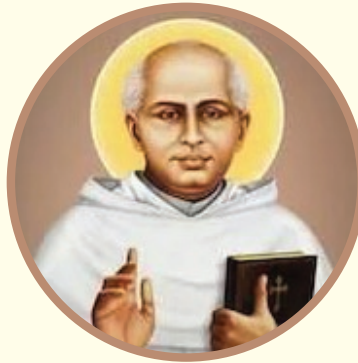
ST. KURIAKOSE ELIAS CHAVARA