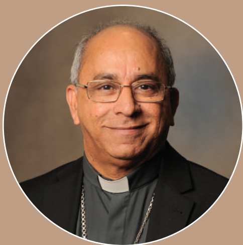
Bishop Bosco Puthur