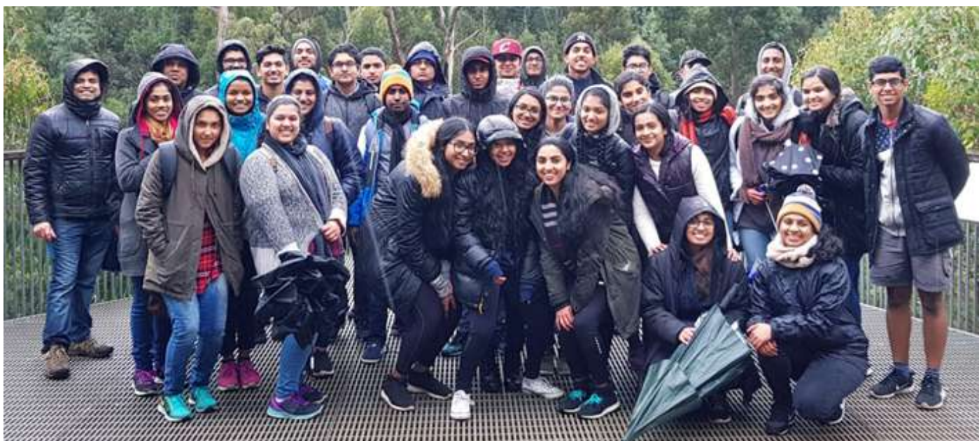
One day trip of the youth group of St Alphonsa Cathedral

enthusiastically looking forward to the one-day programme in July and the regional programme in the month of August.