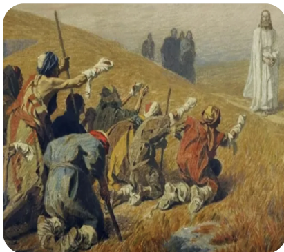
Freedom for the oppressed