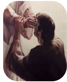
Sight for the blind