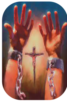
Liberation of those in bondage