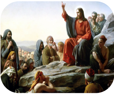
Good News to the Poor